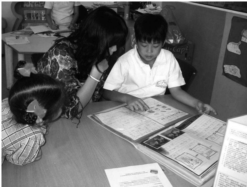
Younger sister attends brother’s parent conference

The prime objective of assessment in the PYP is to provide feedback on the learning process. Bruner states that students should receive feedback “not as a reward or punishment, but as information” (Bruner 1961: 26). Teachers need to select assessment strategies and design assessment instruments to reflect clearly the particular learning outcomes on which they intend to report. They need to employ a range of strategies for assessing student work that take into account the diverse, complicated and sophisticated ways that individual students use to understand their experiences. Additionally, the PYP stresses the importance of both student and teacher self-assessment and reflection (examples 14 and 15).