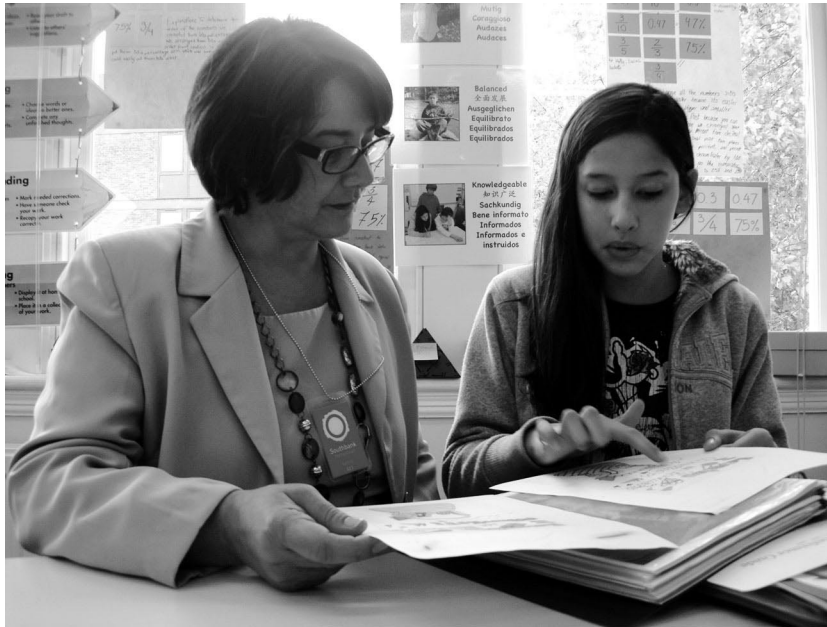
Student discusses exhibition portfolio with mentor

In the final year of the PYP the students participate in a culminating project, the PYP exhibition. This requires that each student demonstrates engagement with the five essential elements of the programme—knowledge, skills, concepts, attitudes, action. It is both a transdisciplinary inquiry conducted in the spirit of personal and shared responsibility, as well as a summative assessment activity that is a celebration and rite of passage, symbolic and actual, from the PYP into the middle years of schooling (example 16).