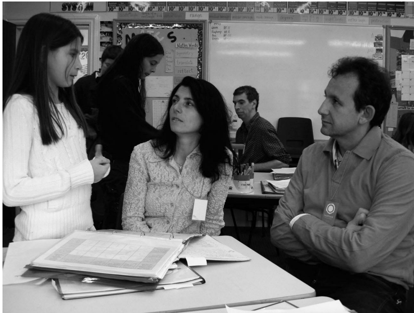
Several student-led conferences take place in classroom

Student-led conferences in a school with a very diverse population provide the opportunity for students to guide their parents or guardians through their recent “journey of learning”, using their mother tongue. Conference tables set up in each classroom are prepared with laminated question prompts translated into multiple languages, for the parents to refer to. The students take their parents or guardians to the tables, where they explain the objectives of the conference: to highlight their “journey of learning”, their personal growth, their challenges and their achievements. The students guide the adults through the contents of their portfolios, discussing the objectives of each included item and indicating their successes and room for growth. Each student has a “personal target sheet” to fill out as they reflect on successes and challenges. Teachers are present but stand apart from the conferences. As they guide the parents or guardians from room to room, the students have a “passport” to be signed by all teachers, to ensure that their development relevant to all areas of the curriculum is discussed.