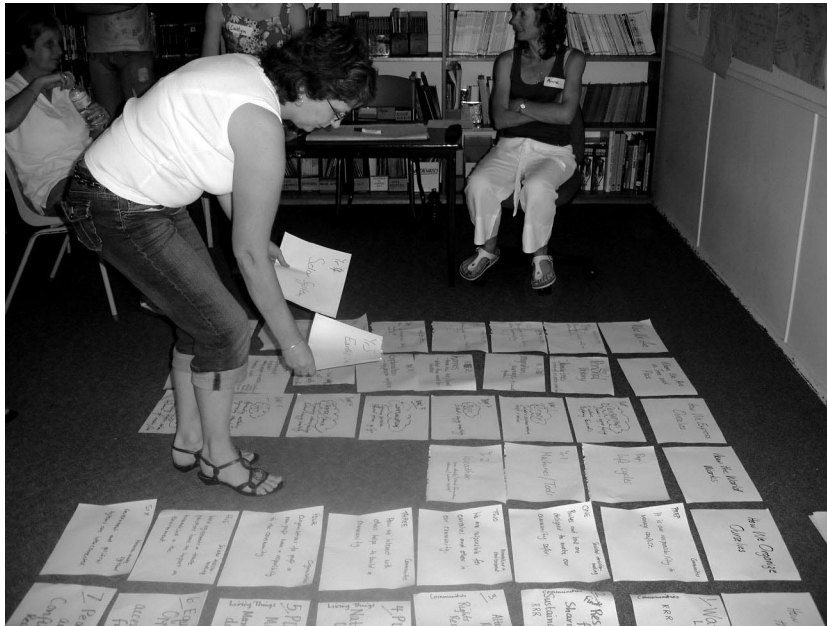
Teachers negotiate placement of units in programme of inquiry

refining a complete programme of inquiry. The proposed units of inquiry at each year level need to be articulated from one year to another. This will ensure a robust programme of inquiry that provides students with experiences that are coherent and connected throughout their time in school (examples 11 and 12).